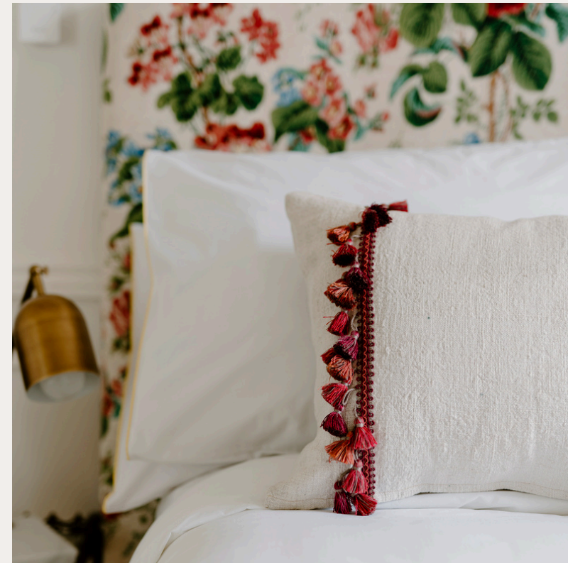
Violet Queen-Bed 26 m2