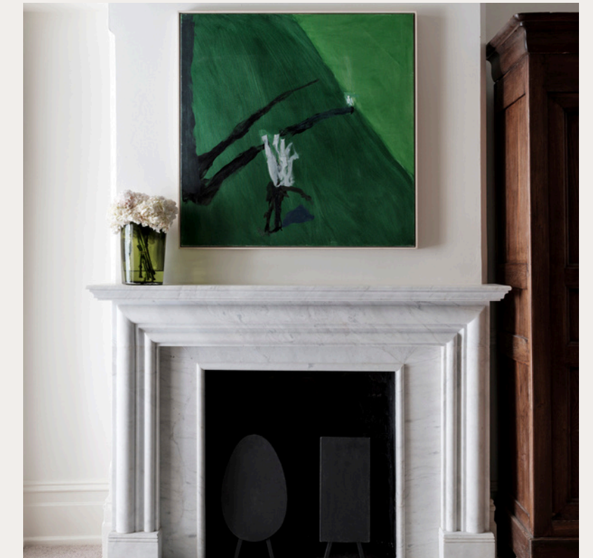
Ivy Queen-Bed 26 m2