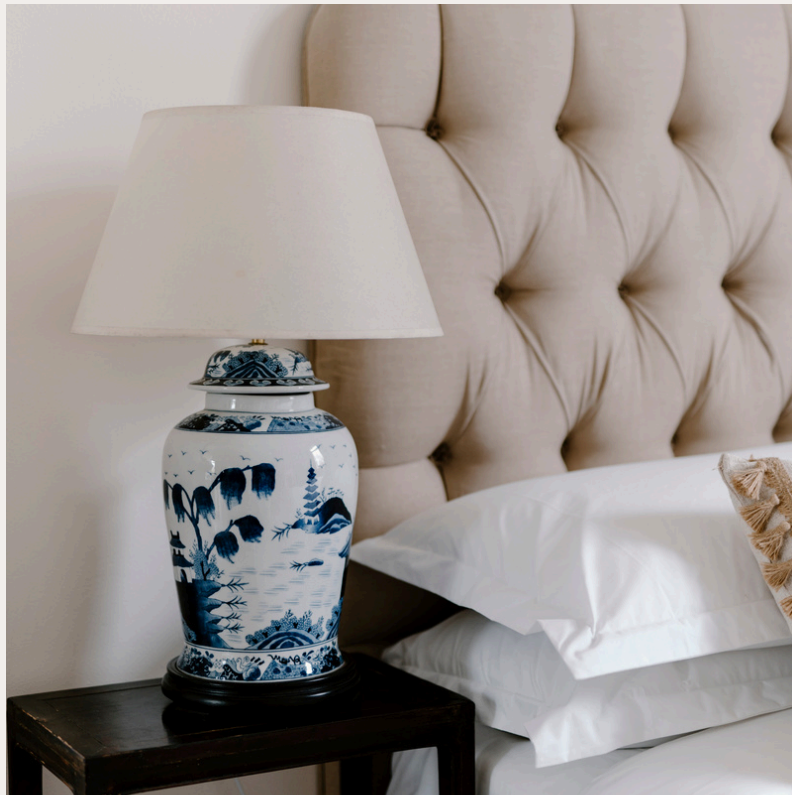
Sophia King-Bed 37 m2

The king-sized Moss Suites: Sophia and Ruby. The queen-sized Garden Suites: RP Club, Ivy, Violet and Daisy. The slightly smaller queen-sized Manor Suites: Rose and Bea.