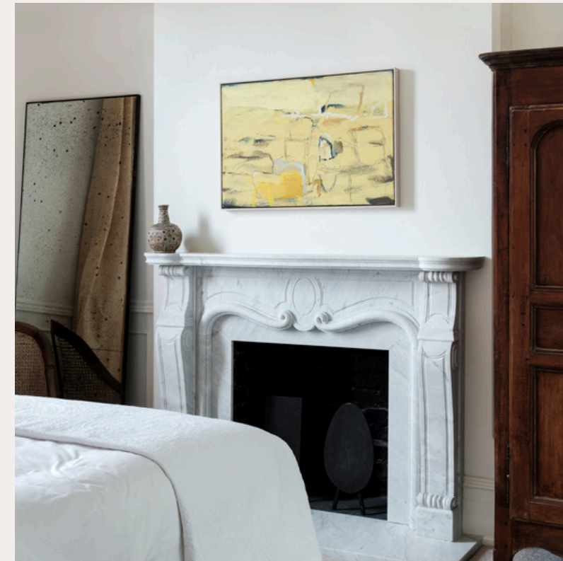
Daisy Queen-Bed 24 m2