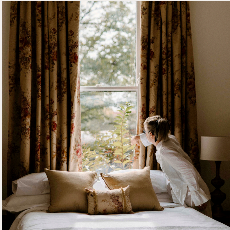
Rose King-Bed 21 m2

Moss Manor has 8 rooms, sleeping 8 - 16 people. Each room has a marble ensuite with heated floors and has been individually decorated with antiques and fabrics that have been sourced over a lifetime; from Italian fringing to Ralph Lauren linen.