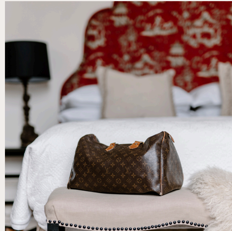
Ruby Queen-Bed 32 m2