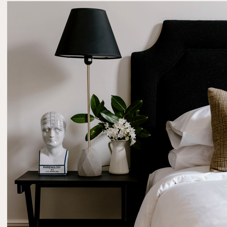
RP Club Queen-Bed 25 m2