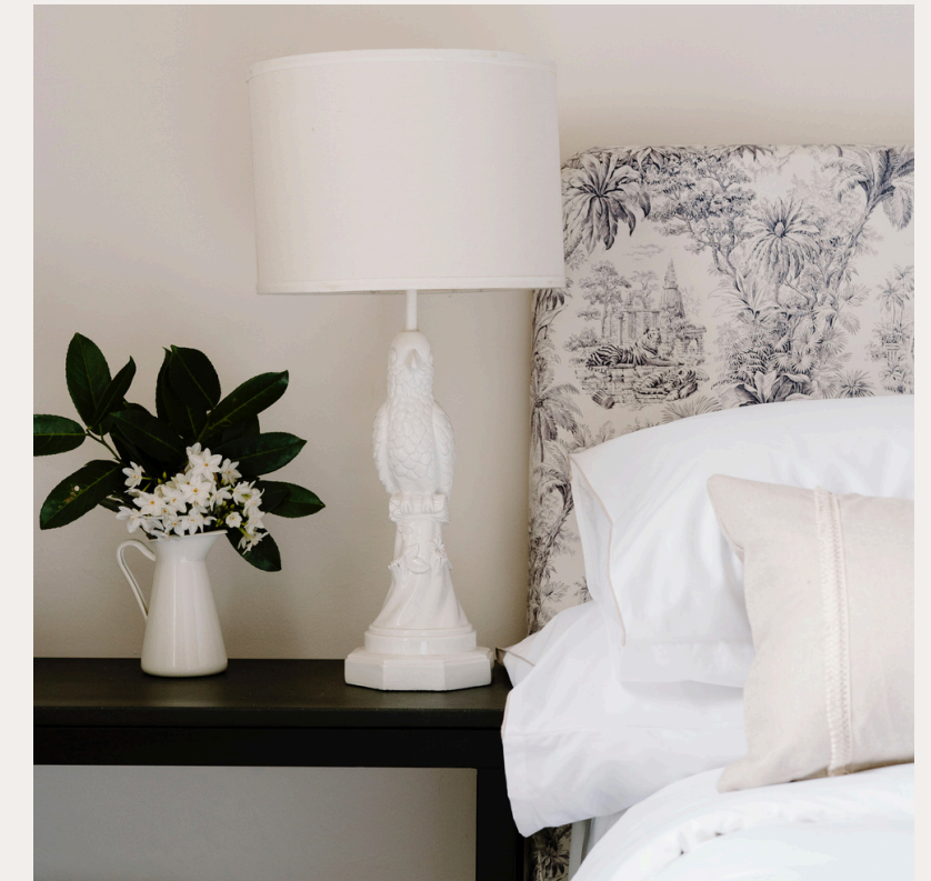
Bea Queen-Bed 22 m2