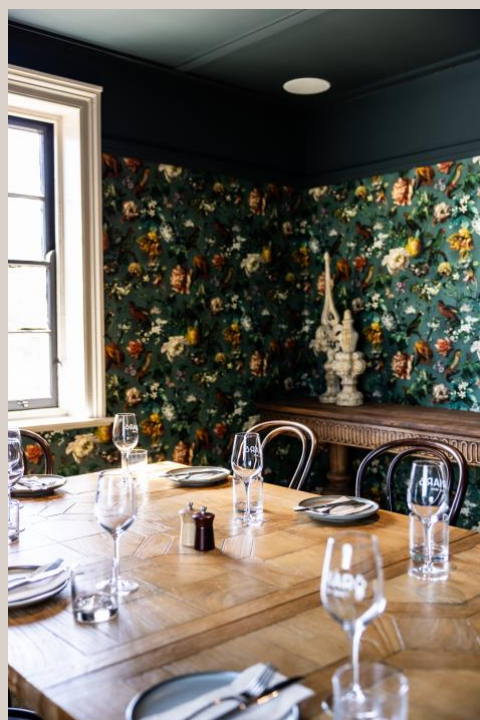
THE BIRDCAGE (12 - 14 Pax)