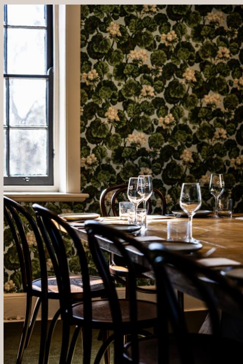
THE BOTANICAL ROOM (12 - 16 Pax)