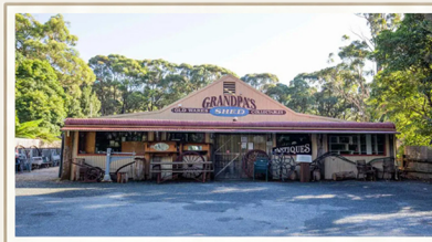
Grandpa's Shed, Fitzroy Falls