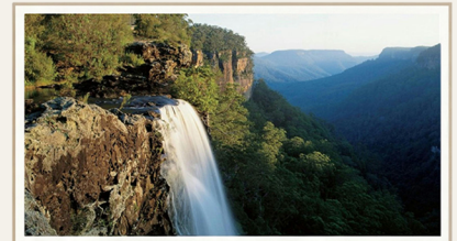
Fitzroy Falls Visitor Centre & Café